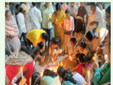
Maharashtra - Nagpur