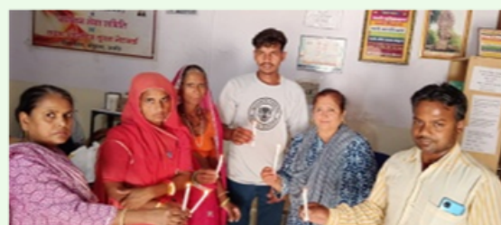
Rajasthan - Ajmer