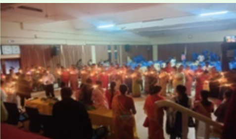
Tamil Nadu- Chennai

Chennai, Tamil Nadu, witnessed the event on May 16, 2024, at Auditorium Gurukul Camps Kilpak. Manipur's Imphal joined on May 19, 2024, led by the Union Tangkhul Baptist Churches. Gwalior, Madhya Pradesh, observed on May 21, 2024, followed by Ajmer, Rajasthan, on May 29, 2024. Ranchi, Jharkhand, remembered on May 30, 2024, and Dhanbad, Jharkhand, on May 31, 2024. Nagpur, Maharashtra, marked the occasion on May 24, 2024, while Aizawl, Mizoram, held their memorial on May 30, 2024. These events underscored nationwide solidarity in the fight against HIV/AIDS stigma.