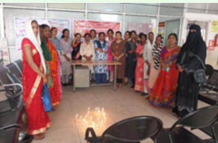
Jharkhand - Ranchi