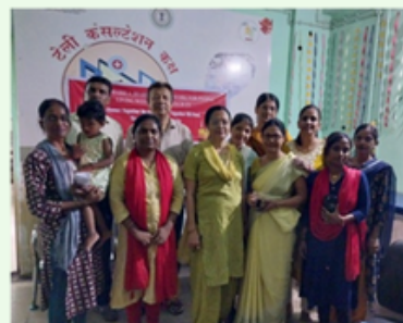
Jharkhand - Dhanbad