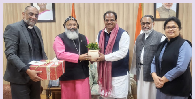
Shri John Barla Hon'ble Minister of State Minority Affairs of India