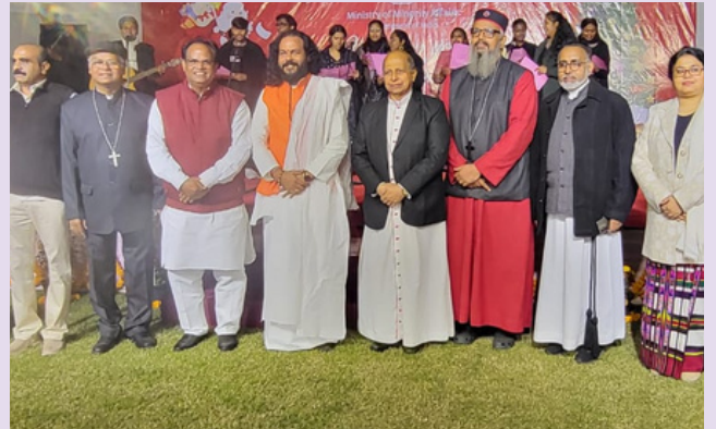
Leaders from different faith traditions at the Ministry of Minority Affairs Christmas Celebration