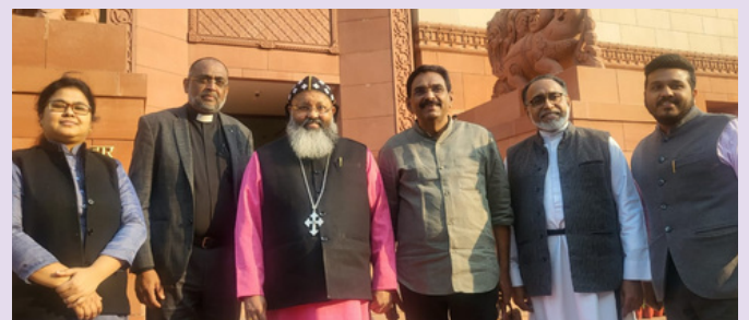
Shri Anto Antony Member of the Indian Parliament for Pathanamthitta