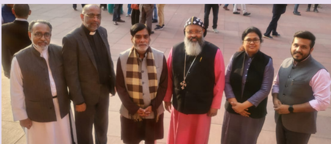
Shri Ram Kripal Yadav Member of the Parliament in Lok Sabha