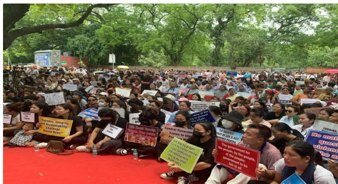
Protest at Jantar Mantar, New Delhi, on 24th June

The youth responds to the Manipur conflicts, where hundreds of Christian Churches and religious centres had been vandalised and destroyed. The unexpected rising incidents since two months the ethnic conflicts between the two communities in Manipur had not settled yet. People had been isolated and sent to different places and there were hundreds of lives lost in the violence.