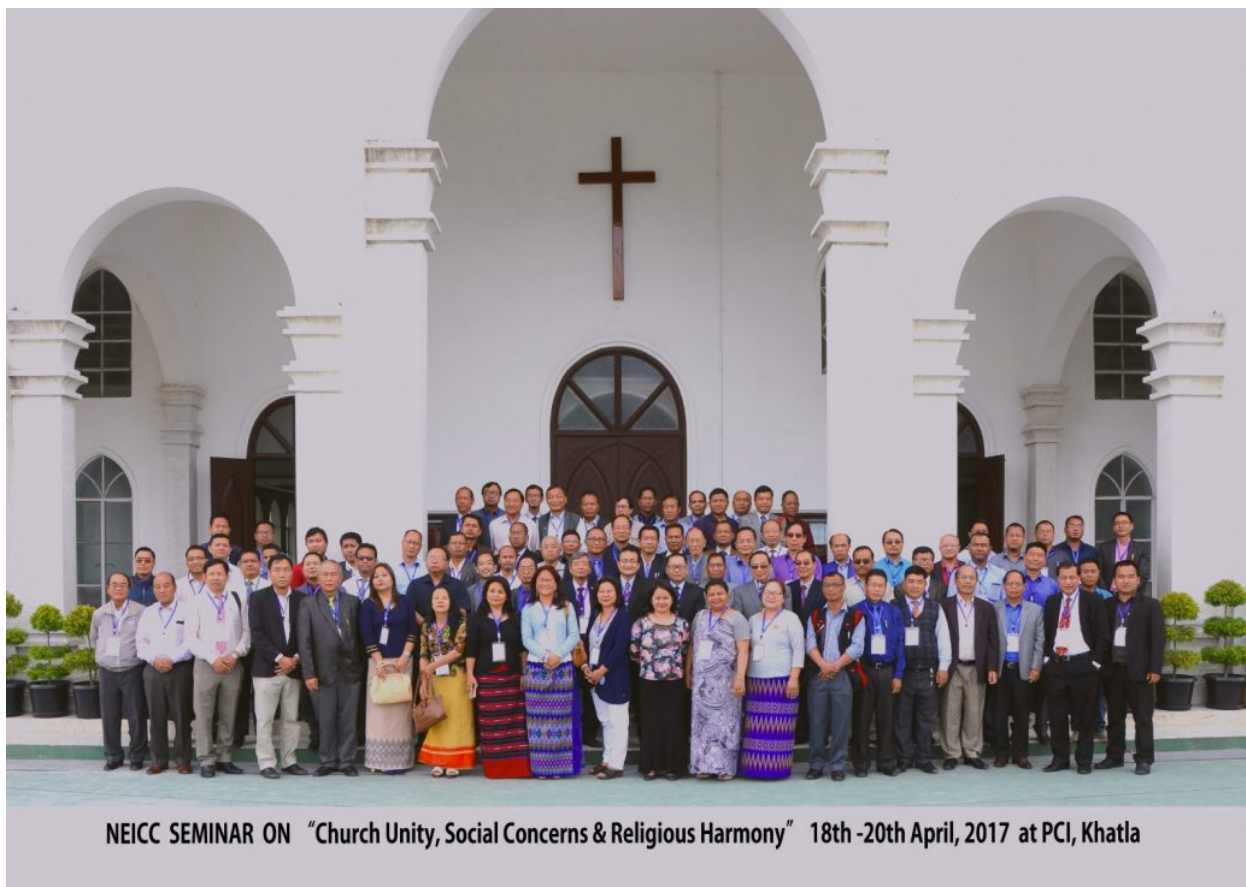
NEICC SEMINAR ON "Church Unity, Social Concerns & Religious Harmony" 18th -20th April, 2017 at PCI, Khatla

STATEMENT OF THE FINDINGS OF THE ONE DAY SEMINAR ORGANIZED BY THE NORTH EAST INDIA CHRISTIAN COUNCIL ON "CHURCH UNITY, SOCIAL CONCERNS AND RELIGIOUS HARMONY" AT THE PRESBYTERIAN CHURCH OF INDIA, KHATLA, AIZAWL, MIZORAM SYNOD, APRIL 19, 2017. We, the ninety two participants, representing various Churches and Christian Organisations under the umbrella of NEICC, in the [...]